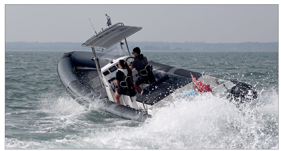
"Beneath its superb gelcoat finish is a structural rigidity that can take the punishment that this sort of boat is likely to receive."