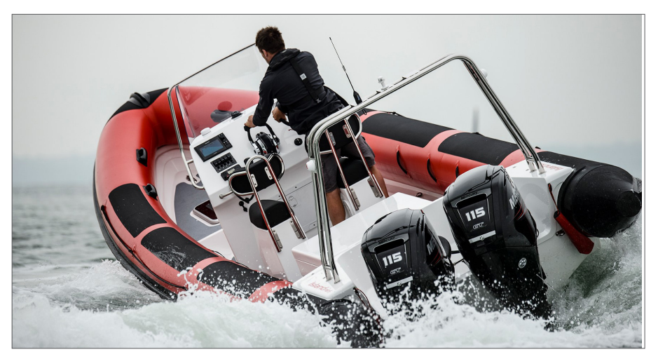
"Beneath its superb gelcoat finish is a structural rigidity that can take the punishment that this sort of boat is likely to receive."